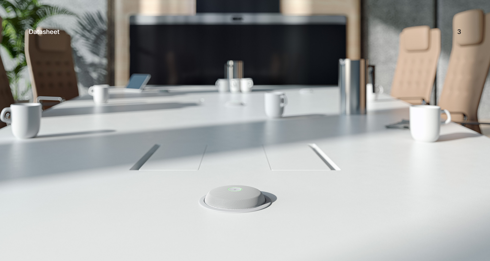
Figure 1. The Cisco Table Microphone Pro recessed into the conference table in a boardroom setting, connected with the Cisco Room Panorama conferencing system.