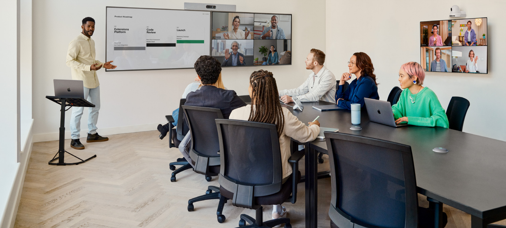
Figure 2. The Cisco Table Microphone Pro used with the extended Cisco Room Kit EQ bundle to provide multi-directional speech pickup from a large meeting room.